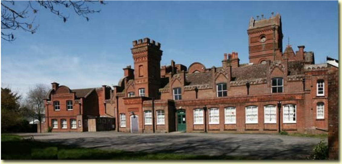
Figure 2 Massey's Folly