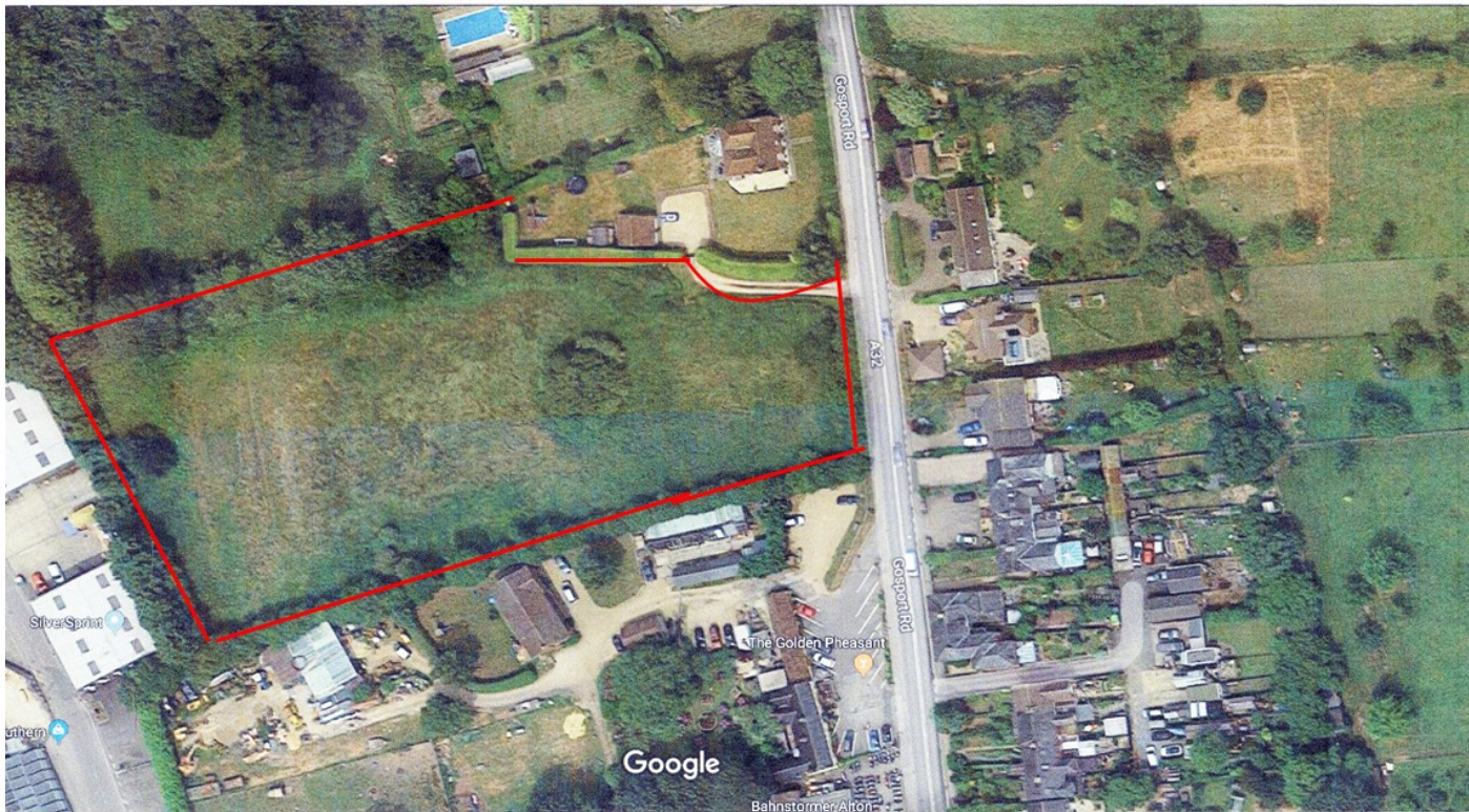
Imagery ©2019 Google, Map data ©2019 20 m

After an extensive and exhaustive search, a site was found and the owner was willing to sell MARELANDS FIELD on the west side of the A32 immediately north of the Golden Pheasant public house.